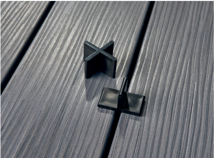
Narrow gap measurement of only 5 millimetres