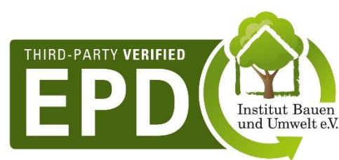
Fig. 2: Logo without reference to standard

Important: The logo may only be used in combination with the following formulation: